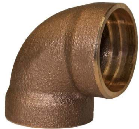
BRONZE ASTM B61 / QQ-C-390 / MIL-B-16541 (ALLOY C90300 / C92200)