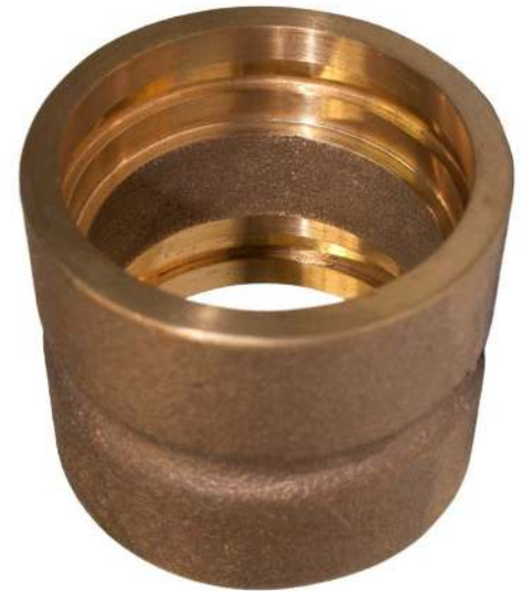
BRONZE ASTM B61 / QQ-C-390 / MIL-B-16541 (ALLOY C90300 / C92200)