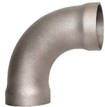
70/30 CUNI (ALLOY C71500)