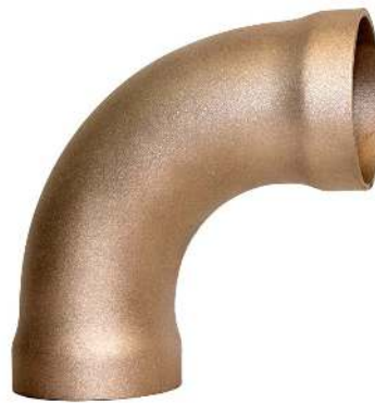
90/10 CUNI (ALLOY C70600)