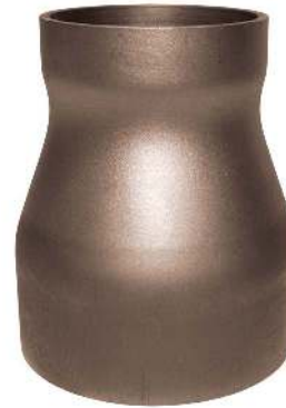
90/10 CUNI (ALLOY C70600)