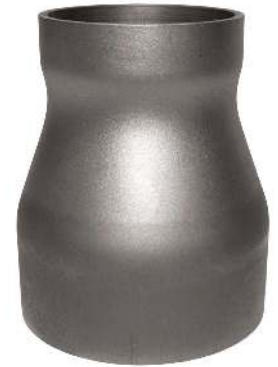
70/30 CUNI (ALLOY C71500)