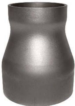
70/30 CUNI (ALLOY C71500)

NOTES: Fittings may be ordered with reduced ends. Sizes not shown may be available upon request.