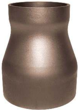
90/10 CUNI (ALLOY C70600)