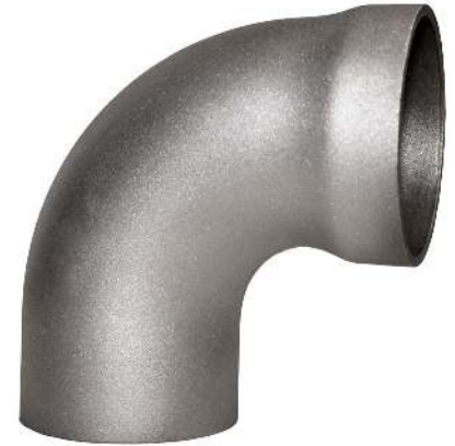
70/30 CUNI (ALLOY C71500)