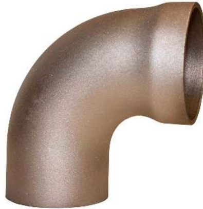
90/10 CUNI (ALLOY C70600)