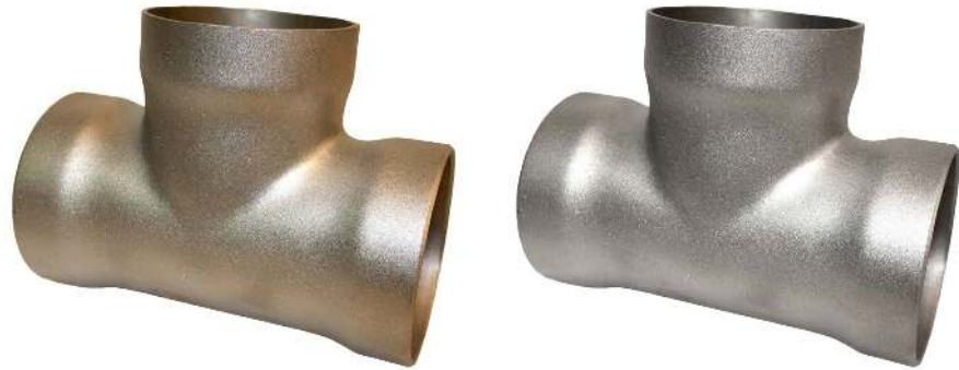
90/10 CUNI (ALLOY C70600)