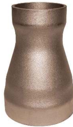
90/10 CUNI (ALLOY C70600)