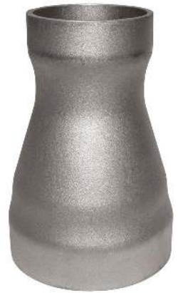
70/30 CUNI (ALLOY C71500)