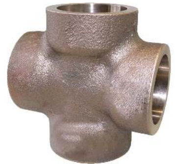
90/10 CUNI (ALLOY C706/C962)