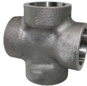
70/30 CUNI (ALLOY C715/C964)