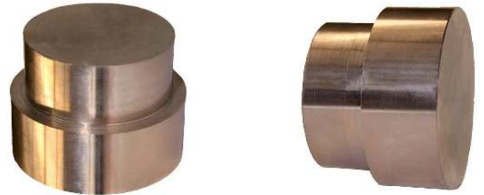
90/10 CUNI (ALLOY C706/C962)