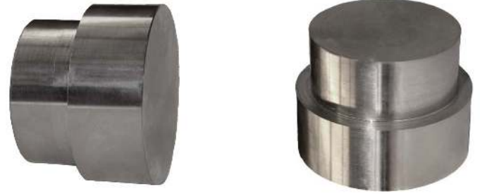
70/30 CUNI (ALLOY C715/C964)