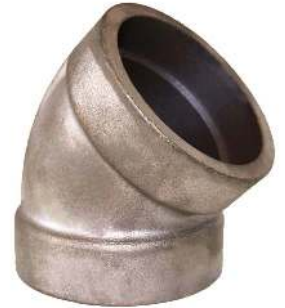
90/10 CUNI (ALLOY C706/C962)