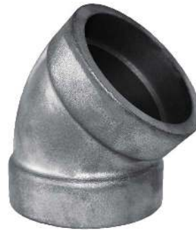
70/30 CUNI (ALLOY C715/C964)