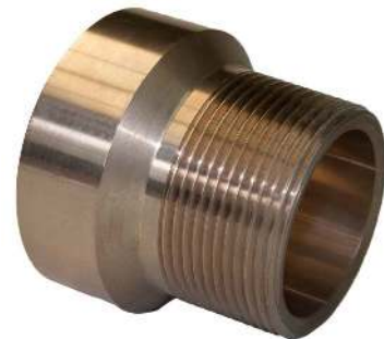
90/10 CUNI (ALLOY C706/C962)