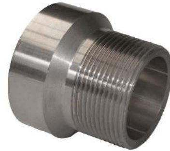
70/30 CUNI (ALLOY C715/C964)